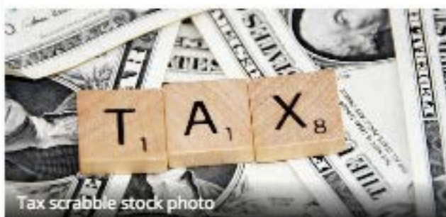
Tax scrabble stock photo